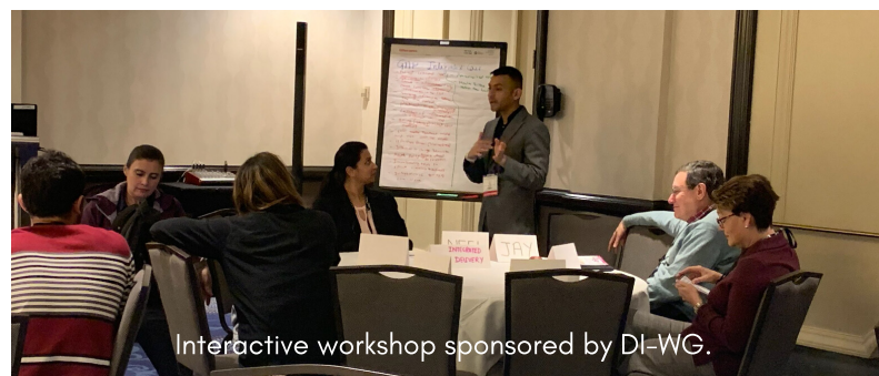
Interactive workshop sponsored by DI-WG.